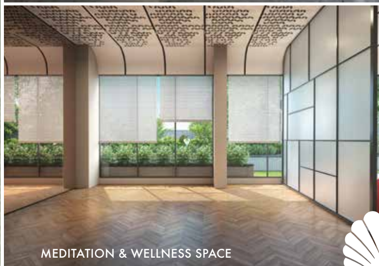
MEDITATION & WELLNESS SPACE